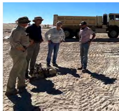
CALIBRE ITAM employees planning erosion control and mitigation actions at the NTC, Fort Irwin, CA Complex

The Infrastructure, Engineering, & Environment (IEE) Directorate had a very successful 2023. The outstanding achievements of the entire IEE team include winning all the recompetes in our portfolio that CALIBRE was eligible to bid, a new award to provide Integrated Training Area Management (ITAM) services at the National Training Center (NTC), Fort Irwin, CA and substantial on-contract organic growth on our Army Base Realignment and Closure (BRAC) support services contract.