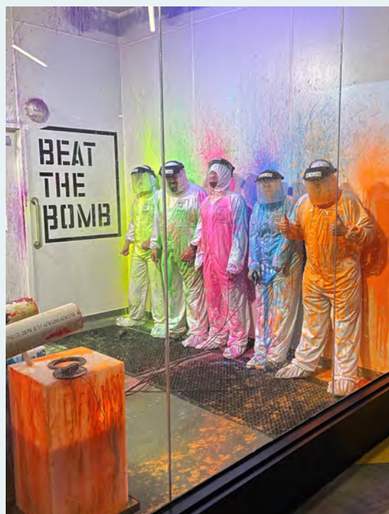
The TT&S team had an action packed team building experience at Beat The Bomb in Washington, D.C.