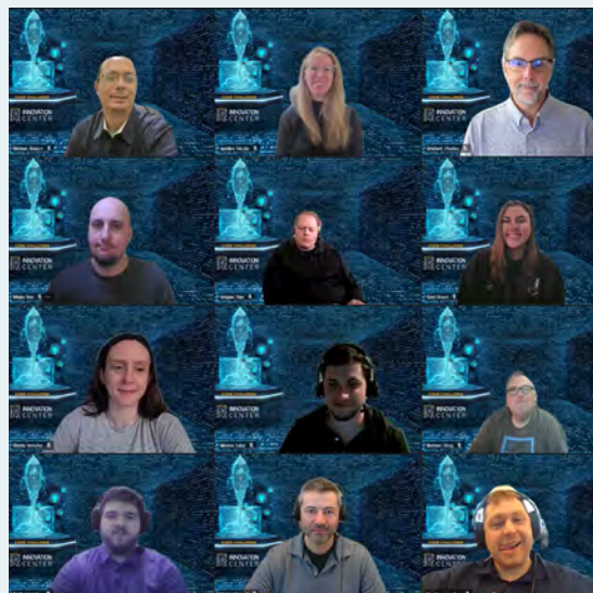
Employees participating in the first-ever CALIBRE-wide Code Challenge demonstrating their problem-solving, coding abilities, and logical thinking