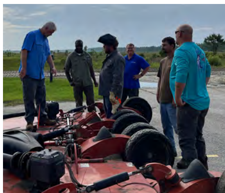
CALIBRE employees on the Fort Stewart Range Maintenance task order conducting tank live fire range maintenance at the Red Cloud Complex