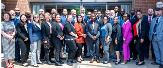
CALIBRE employees who have successfully completed the VA TAP training, alongside the dedicated team responsible for conducting the training