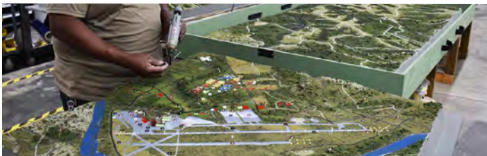
Training Support Center Contract, Ft Moore, Georgia. Team CALIBRE created a terrain mock-up of the future end-state of Lawson Army Airfield after planned improvements to be completed by year 2035

The ICS team looks forward to providing even more impactful changes to support the client mission in 2024.