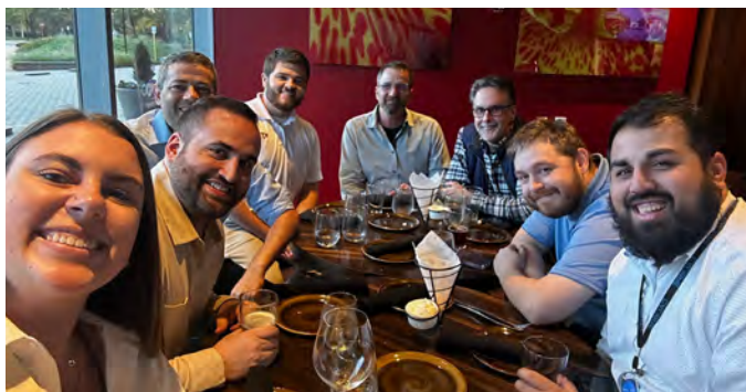
Social gathering with members from the TT&S team

We anticipate that Generative AI will have a transformative impact on the management consulting market in the long term, and we aim to take a leading role in this domain. Therefore, in 2024, we will explore opportunities to integrate GenAI in our operations and intend to develop at least one new service offering utilizing this technology. We will expedite proposal development by leveraging GenAI. Additionally, we will develop Shift Left RMF for SQLServer and PostgreSQL, along with a solution for Software Bill of Materials (SBOM) in the DevSecOps pipeline.