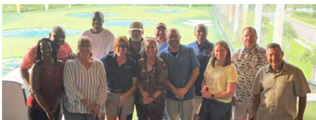
The Growth Team gathered for team bonding while taking a break from business strategy discussion and account planning

In 2024, we will leverage our new Prime vehicles to pursue select task orders, leveraging our core capabilities and past performance in management consulting and digital transformation expertise.