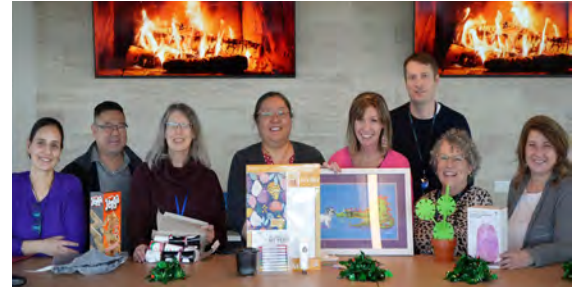
Members of the NIDA project team (and friends) at the holiday potluck and white elephant gift exchange