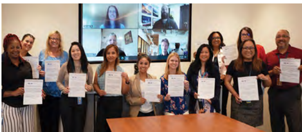
The HR Division proudly signing the 'Disability Inclusion Pledge,' reaffirming their dedication to building a diverse, equitable, and inclusive workplace

In 2023, we continued our journey to intentionally increase employee engagement and maintain a retention rate that is better than industry standards while fostering a workplace that values and celebrates differences. The HR Division signed the "Disability Inclusion Pledge" signaling our commitment to creating a diverse, equitable, and inclusive environment and an accessible workplace for all. Additionally, many of our HR team members completed SHRM's "Employing Abilities" certification program which provides guidance on how to recruit, hire, and retain individuals with disabilities. HR is passionate and dedicated to creating an inclusive environment where employee-owners feel valued and respected.