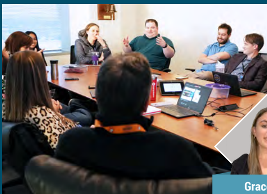
Employees engaged in a vibrant discussion during a Young Professionals ERG meeting